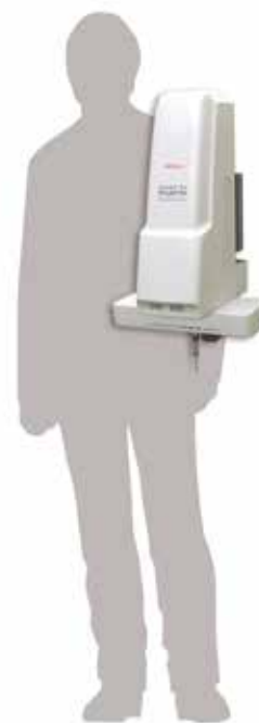
MACH Ko-ga-me size compared to a human body